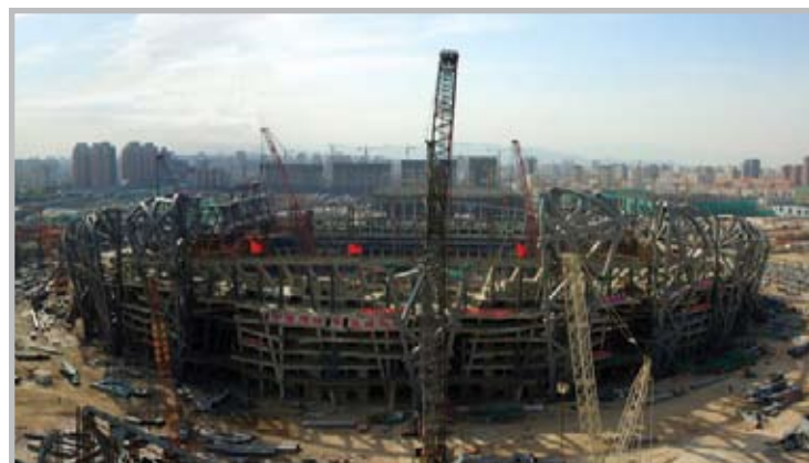
Construction site of the main stadium for the 2008 Summer Olympic Games to be hosted in Beijing

RMS' spectral response methodology provides the most advanced approach available for modeling